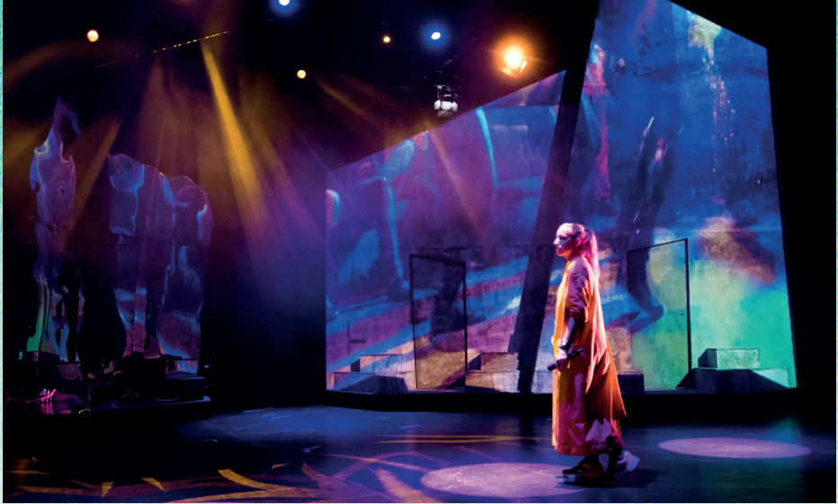
THE NOSE – A Dance Rap Opera (2021).