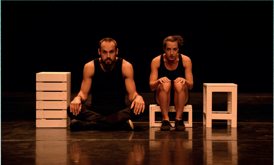
GAP of 42 (2020).

Chris and Iris have a background in contemporary circus and are influenced by performance art. They also incorporate physical theatre, contemporary dance, and object theatre into their work. They have worked as hand-to-hand acrobatic duo since meeting and studying at the Academy for Circus and Performance Art Tilburg (NL). Since 2011, they have collaborated with well-known companies such as Cirque Éloize (Canada) or Cirkus Cirkör (Sweden) and performed in the Roundhouse in London, La Tohu (Montreal), the Sydney Opera House or the Chamäleon Theater Berlin. They have been awarded various prizes at circus festivals (e.g. a silver medal at the Festival Mondial du Cirque de Demain, Paris). In recent years they co-founded Common Ground, a Belgium/German collective of six artists.