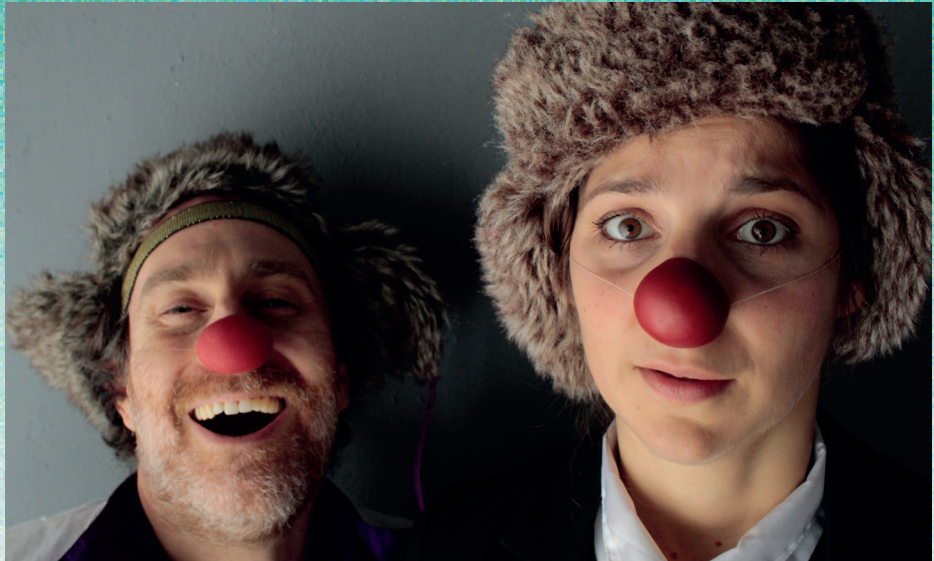
Snowflake Deliveries (2017).

Since 2015, Fort Willy have been producing contemporary clown theatre with international artists. Based in Cologne, core members Olivia Platzer (AT) & Bryce Kasson (USA) share influences from dance improvisation and somatics to Buster Keaton and Prince. Our combined backgrounds in music, dance, theatre, and performance art led us both to train in clown technique in Buenos Aires before forming the company.