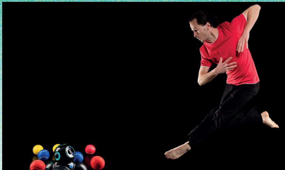
DASH und BALAZS (2019).