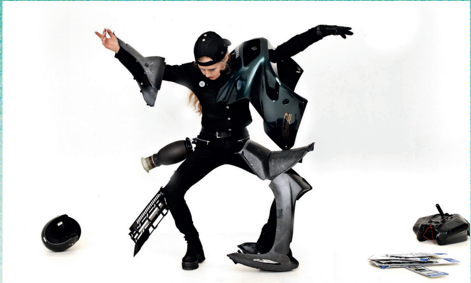
Shiva's Spare Parts (2020).