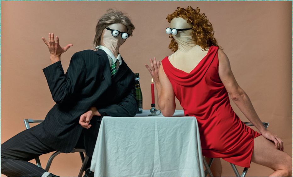
Duo Mimikry.

Duo Mimikry is a contemporary, visual comedy-theatre duo from France and Germany that uses experimental puppetry and postmodern mime to deal humorously and critically with social issues. Physical perfection, the voluminous elaboration of their characters, dramaturgical surprises, and a distinctive, sometimes rather ribald humor are their trademarks.